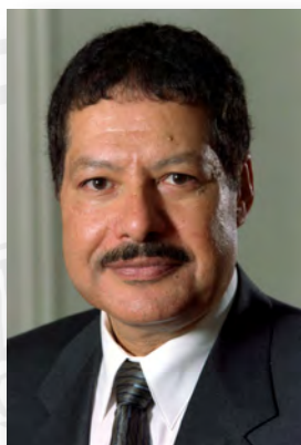
Ahmed Zewail California Institute of Technology